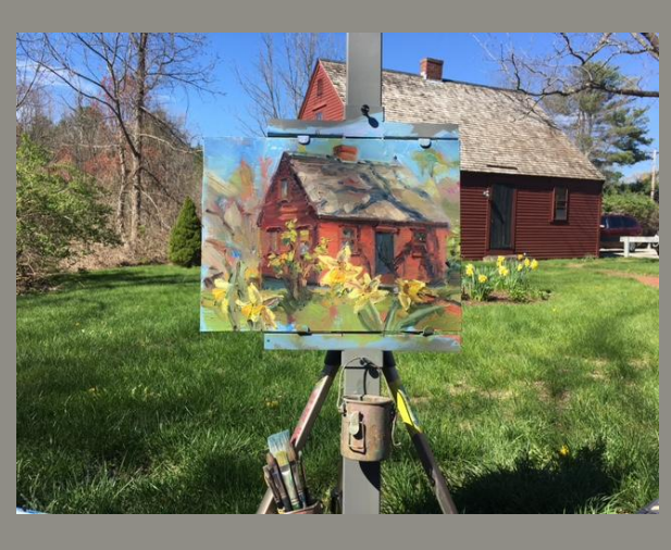
Plein air painting by C Nixon