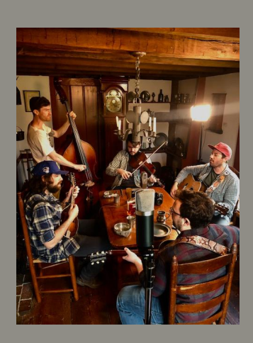
WHCM Plein Air Series