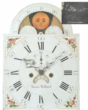
Fig. 33. 12 inch Auron Willard tall clock moon dial signed 'J. Minott / N. 222' on rise.